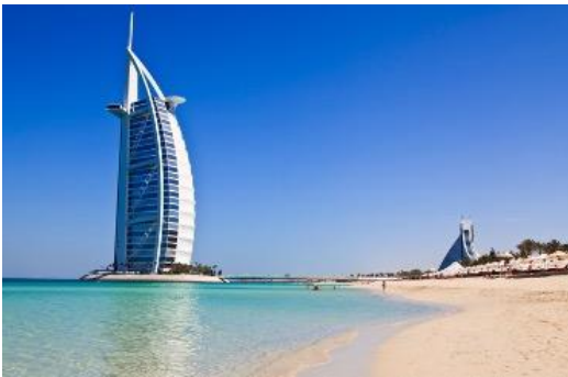
Karen Middle East

Note: 3 of our 4 mission partners grew up at our church, and 3 are now serving the Lord in the Middle East!