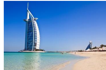
Karen Middle East

Note: 3 of our 4 mission partners grew up at our church, and 3 are now serving the Lord in the Middle East!